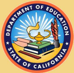
TOM TORLAKSON State Superintendent of Public Instruction